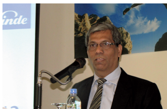
Managing Director is addressing the audience on Management Conference

The annual Management Conference 2012 was held at BRAC CDM, Savar on 24 December 2012. The conference reviewed the performance of 2012 and set target for the year 2013.