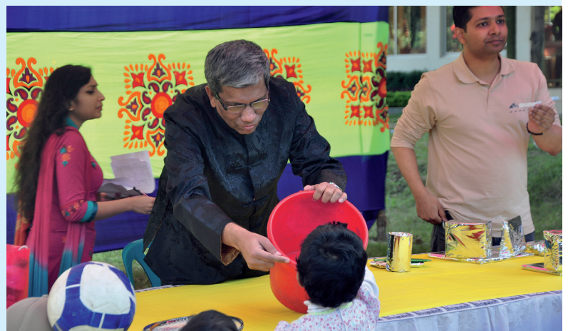
Managing director is handing over a memento to a toddler in picnic

There were different events both for family members and employees to participate and win attractive prizes and thus everyone gets recharged spending quality time together.