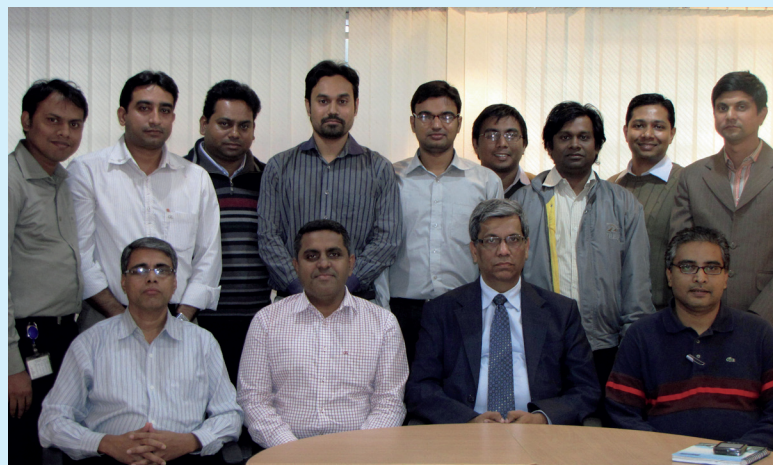
Managing Director is seen with the participants of the workshop